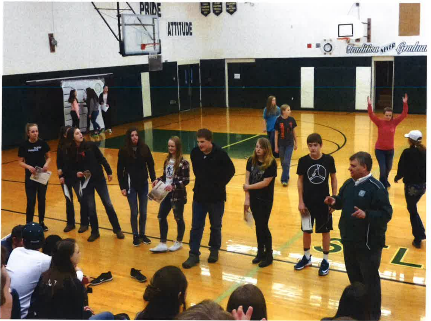
Students earning a 4.0 GPA in the fall semester of 2016 are honored.