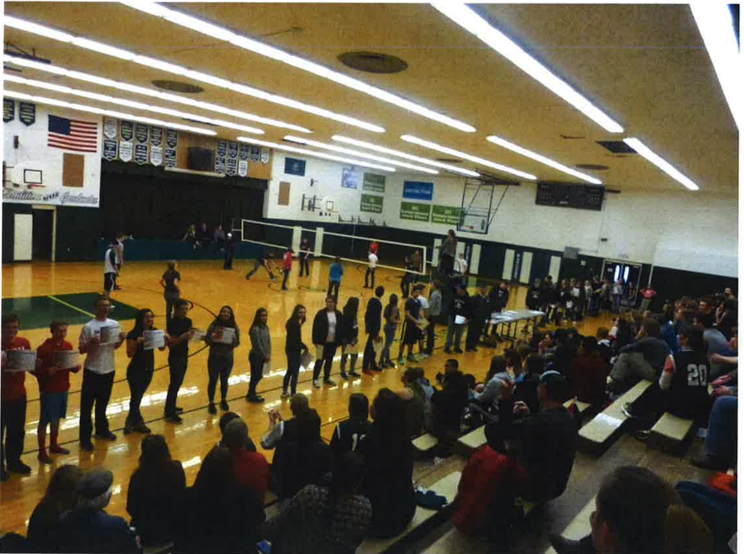
The line of students earning a 3.5 GPA in the fall of 2016 stretches from one end of the gym to the other!