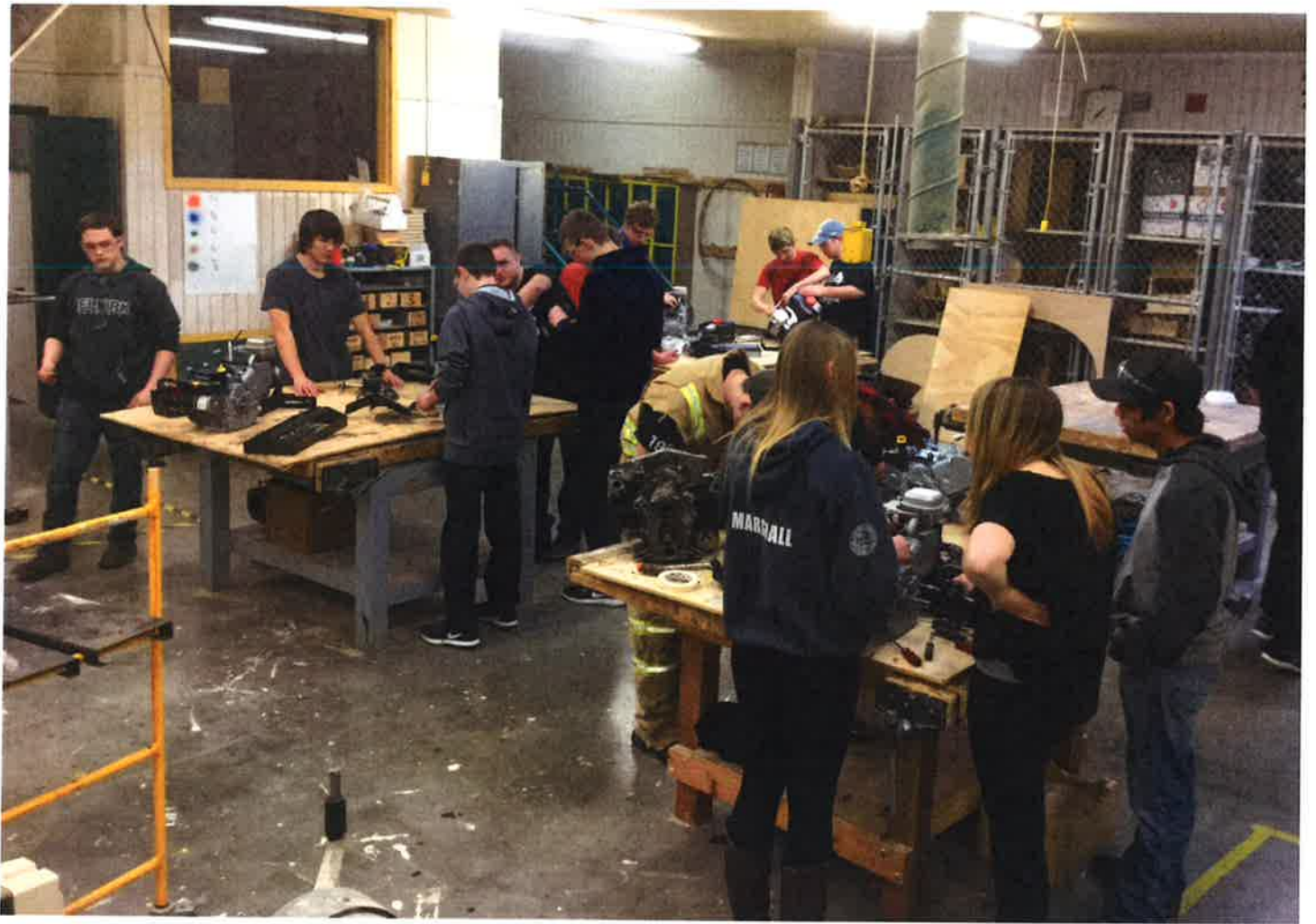
Small engines students tear down and rebuild engines donated by Briggs and Stratton.