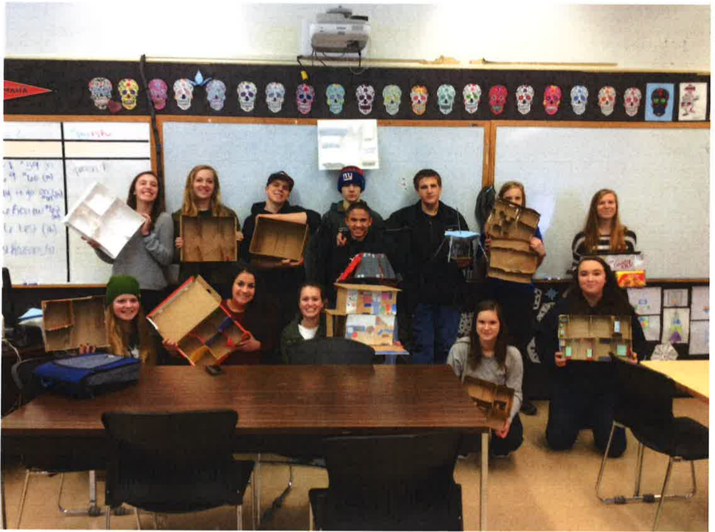
Mrs. Snow motivated Spanish students to engage in class with a board game production.